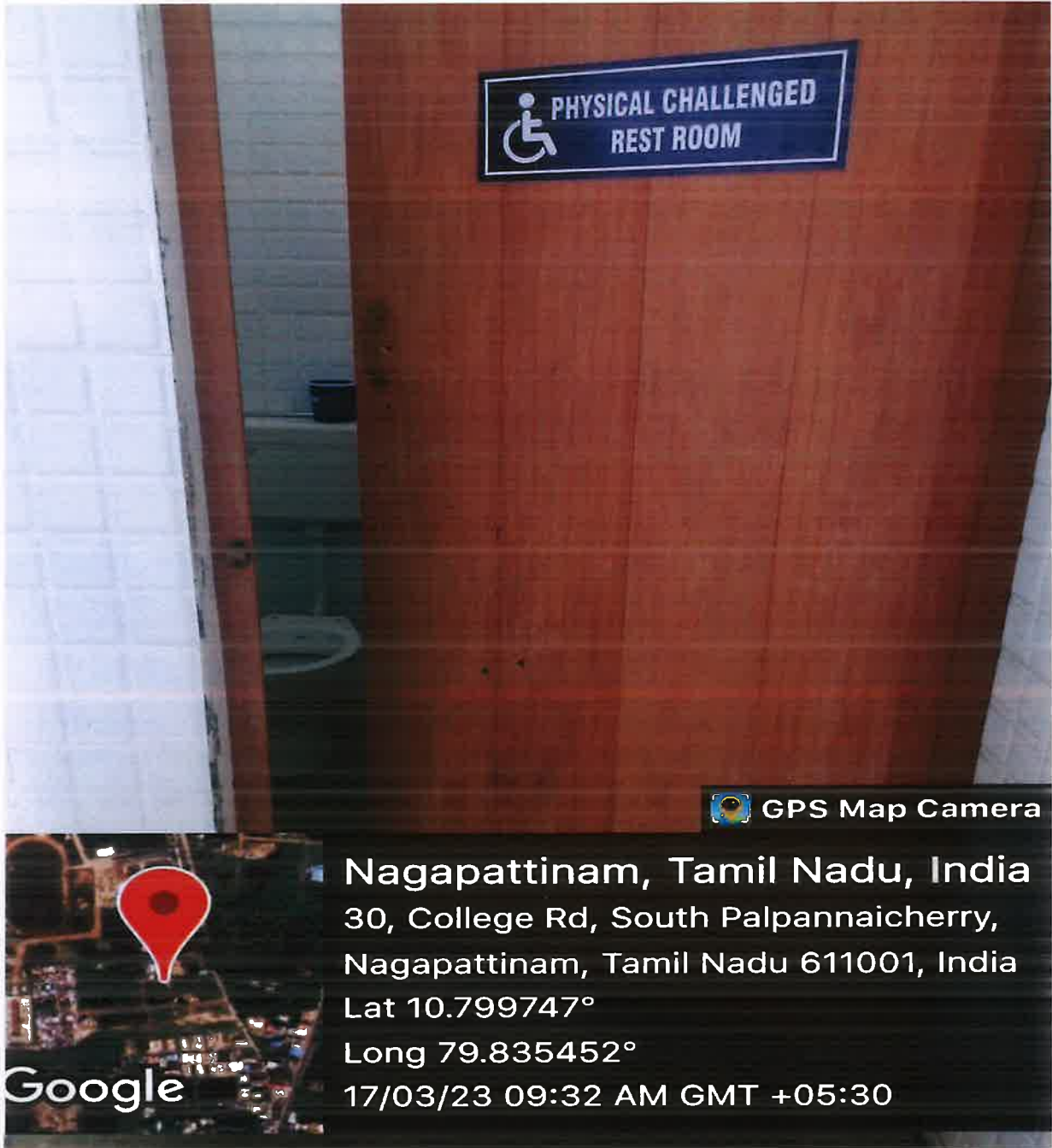
Disabled free washroom