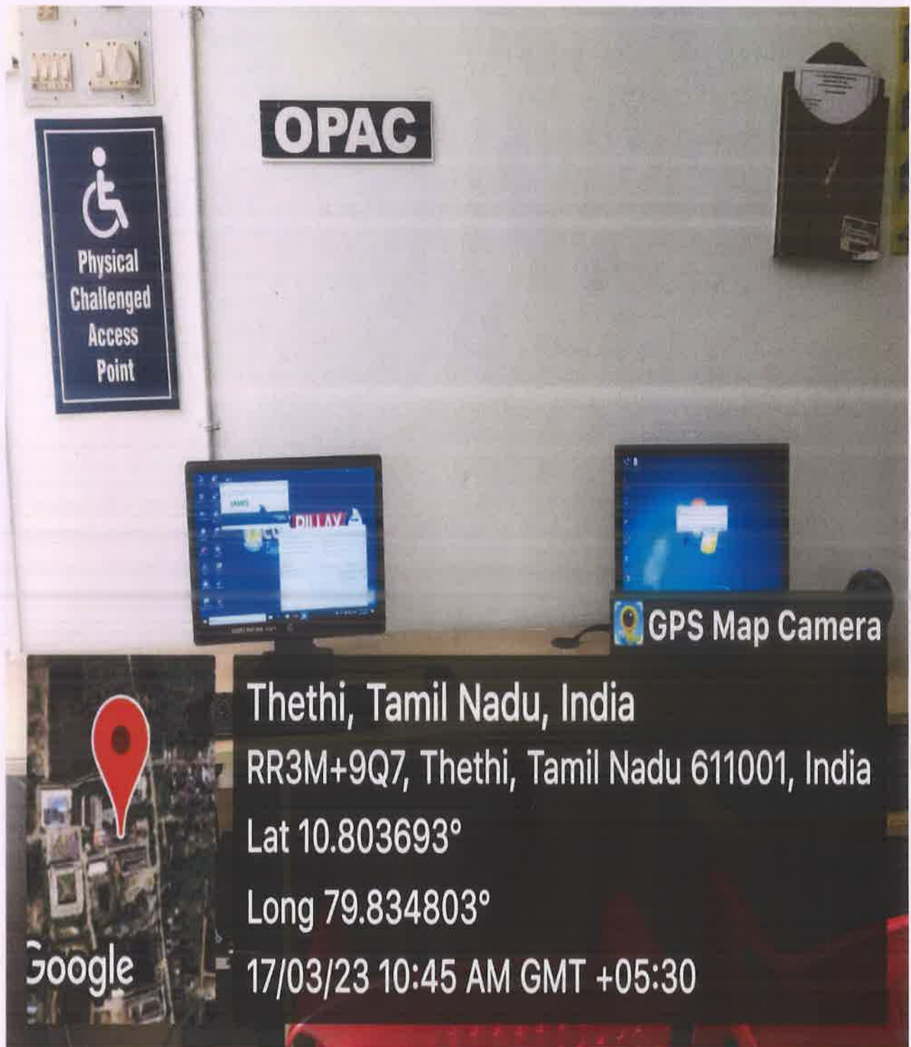
Physically challenged person access system (Library)