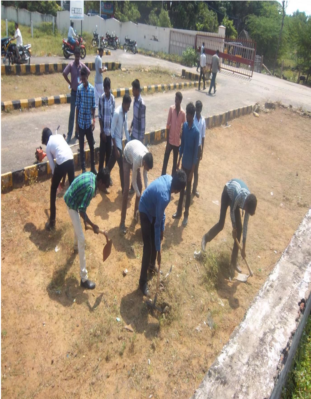
CLEAN CAMPUS PROGRAMME -22.09.2017

Email: principal@egspec.org website: www.egspec.org Ph: 04365-251112