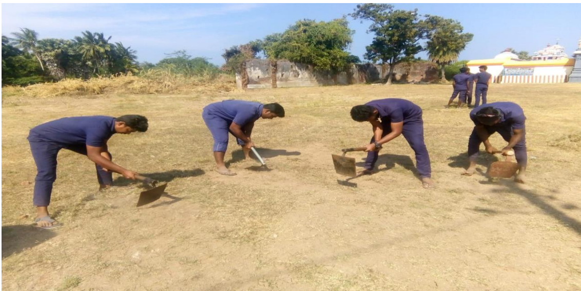
02-03-2020 Temple Cleaning work