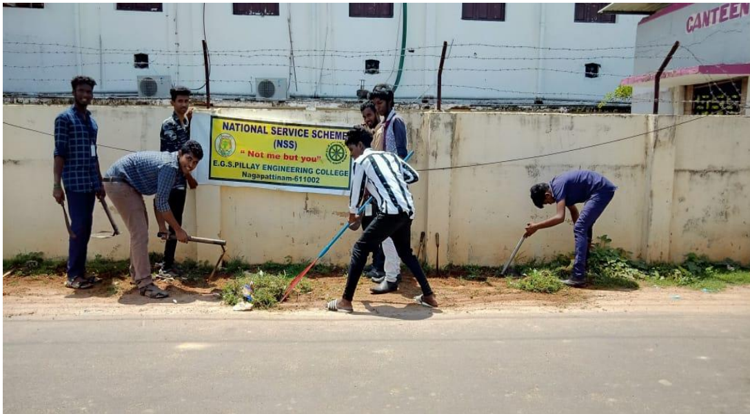
15.09.2019 Road cleaning work at Thethi

Email: principal@egspec.org website: www.egspec.org Ph: 04365-251112