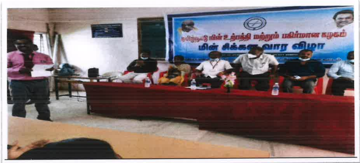
First 'Energy Conservation and Electrical Safety Pamphlet' received by the Secretary from the ChiefGuest