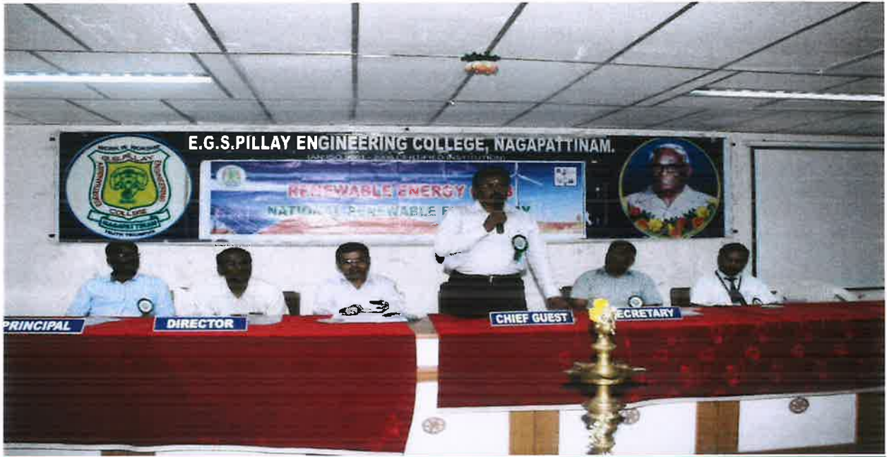
FELICITATION OF CHIEF GUEST

CELEBRATION OF RENEWABLE ENERGY DAY ON 20-08-2018